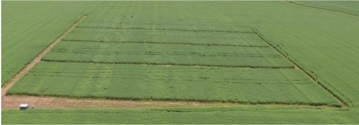
Figure 3. The greater degree of lodging in the 3 strips of canola that were planted with a drill was visible in aerial photos.

Yield Results: Plots were harvested with a Claas Lexion 750 with an auger head, an extended pan and knives on either side of the header. There were no significant differences in yield based on seeding rate. This is well documented in scientific literature; individual canola plants will branch out and yield more when populations are lower, and a stand can meet yield potential at populations ranging from 5 to 20 plants/ft 2 . In addition, the yield of plots planted with the drill did not differ from yield of planted plots.