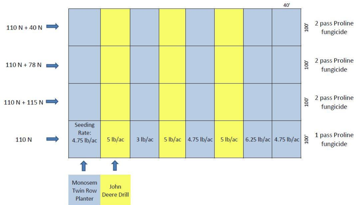
Figure 1. Canola agronomy trial layout. Seeding was conducted in the north-south direction, nitrogen and fungicide were applied east-west across the plots. Drilled plots (in yellow) were seeded at 5 lb/ac, and were replicated 3 times. Planted plots (in blue) seeded at 4.75 lb/ac were replicated 3 times; plots planted at 3 and 6.35 lb/ac were not replicated.

It is suspected that rates of nitrogen commonly applied in Ontario canola may not be high enough to support yield potential. Canola requires approximately 3-3.5 pounds of nitrogen per bushel of grain produced. The yield goal for this field was 75 bu/ac, so the highest nitrogen rate used in the trial (225 lb/ac) reflects the 3 lb N/bu requirement. The form of nitrogen used in the trial was Amidas, a homogenous granular fertilizer containing urea and ammonium sulfate (7:1 N to S ratio). During the season, some potassium deficiency was observed in tissue testing.